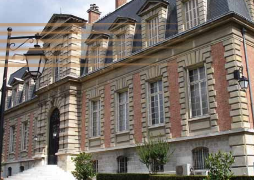
The Institut Pasteur's historical building

Director of the Unit on the Epidemiology of Emerging Diseases, Institut Pasteur.